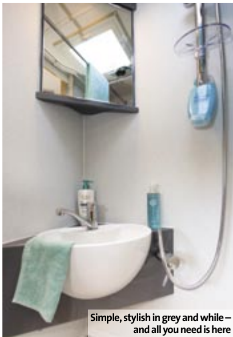
Simple, stylish in grey and white – and all you need is here