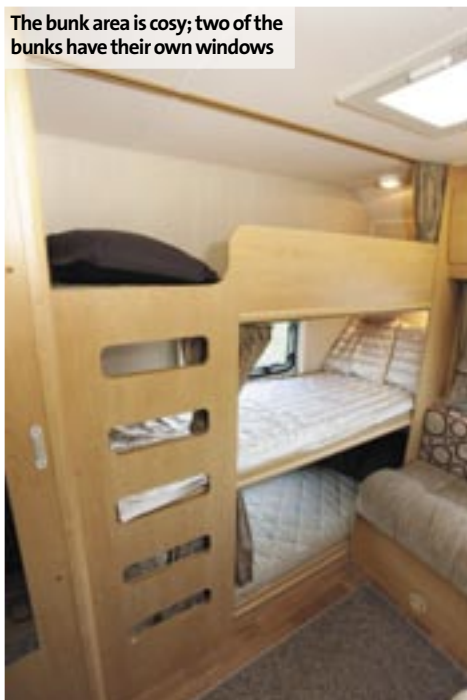
The bunk area is cosy; two of the bunks have their own windows