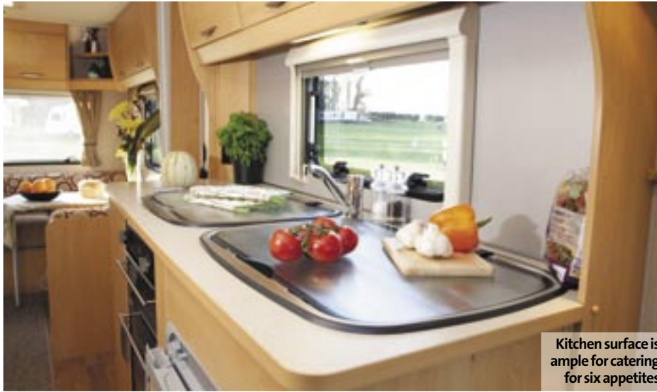
Kitchen surface is ample for catering for six appetites