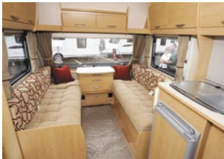
Long settees that make single beds as well as a double