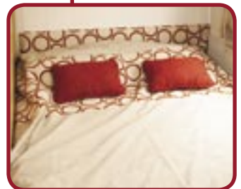
A beautiful bedroom with good-sized head-height lockers for storage