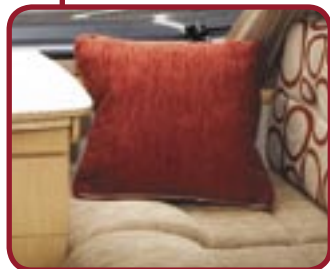
Bold terracotta cushions and large circles on the seats add loads of style