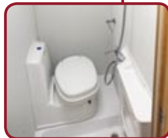
You step through the shower to the toilet - a small but practical space