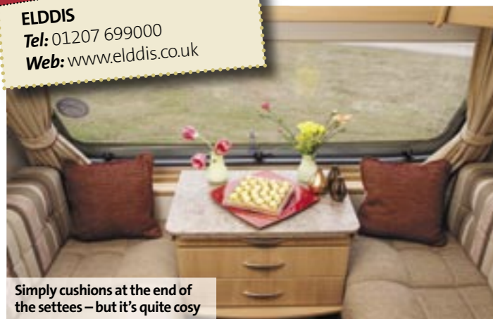
Simply cushions at the end of the settees – but it's quite cosy

GET IN TOUCH ELDDIS Tel: 01207 699000 Web: www.eddis.co.uk