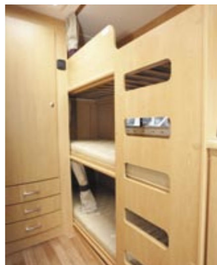
Triple bunks at the rear nearside

Opening the chunky washroom door reveals an oversized washroom with separate shower. So what about the beating heart of the Tempest: sleeping and those triple bunks? Are they the big news? Excellent, yes, but no longer big news. The news is the way they've been integrated into the layout. They're only used at night, so why make a feature of them? Here, they're out of the way so as not to interfere in daytime living. Perfect. And, with three kids loaded in them, the loo is right opposite, meaning no trek through the caravan. ■