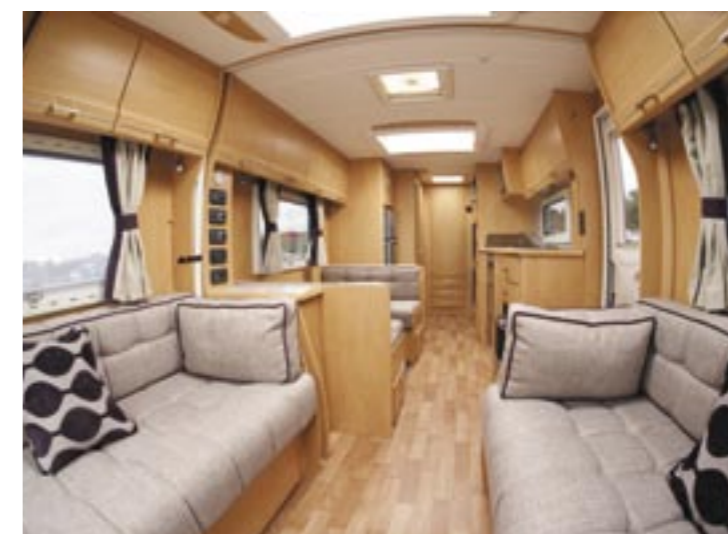
One long corridor the entire length of the caravan; the bunks are to the right at the rear

Axes: 2 Berths: 6 MRO: 1622kg MTPLM: 1880kg Width: 2.28m Overall length: 7.96m Headroom: 1.91m