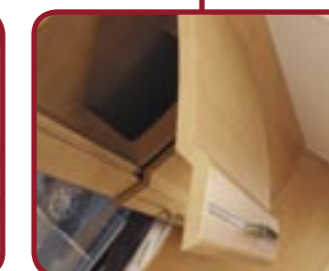
Locker edges are an interesting angular shape