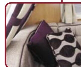
Rich purple teamed with grey is a daring combination - and it works