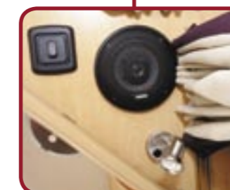
Under the front pelmet, speaker, spotlight and light switch