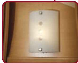
The corner mains-powered lights are plain, gently curved and stylish