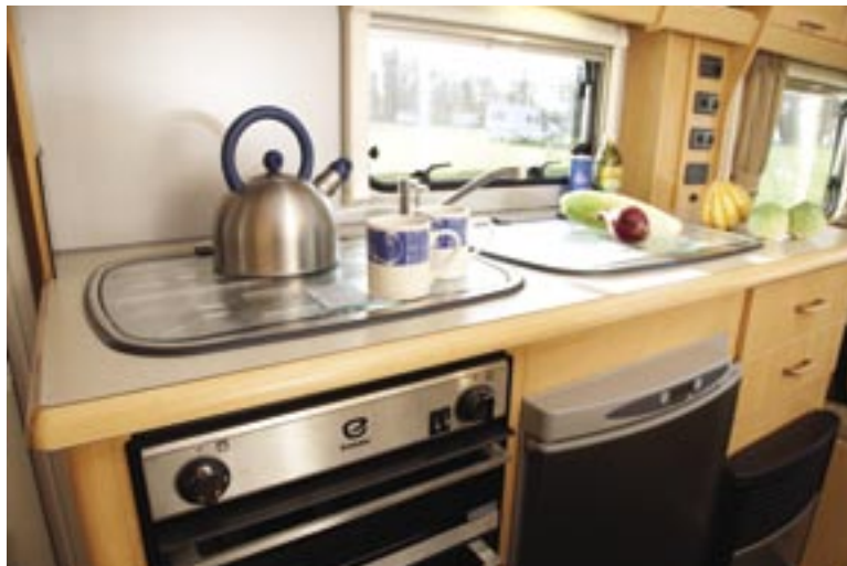
There's a useful amount of work surface to the right of the sink