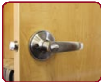
A robust washroom door handle - well-made, like the rest of the 524