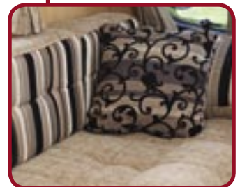
Great, bold stripes - and a touch of traditional pattern in the cushions