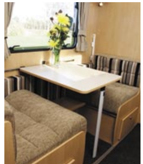
The side dining area - or young persons' bedroom

Storage (kitchen apart) comes well up to standard for four people. Seven head lockers, plus one (fitted) above the kitchen and two more (smaller) over the front, give you ample places to stow stuff. ■