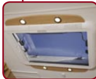
Four spotlights surround the front roof light - ample light and style, too