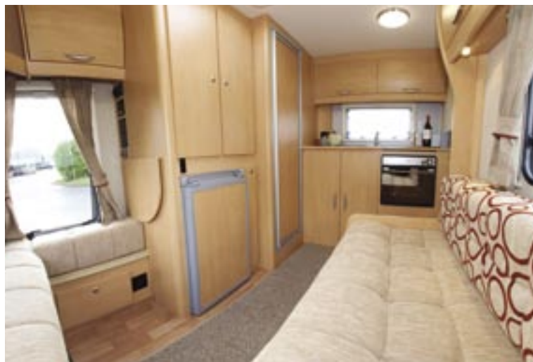
The tiny 302 looks and feels much larger than it is because its lounge is L-shaped