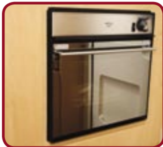
The combination oven and grill saves space and weight