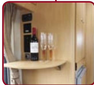
The television table hinges up on the offside beside the deep window