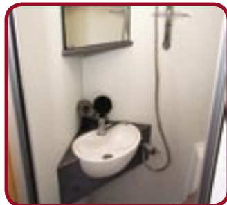
The shower is surprisingly large for a caravan of such small proportions