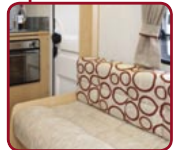
When the bed is made up the end of this seating area is still available.