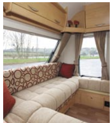
The one-piece front window and offside long window let in plenty of light

Bright, light styling is a feature of the living area, also. Upholstery inevitably dominates the look of a caravan which is only just over three metres long and whose settees are more prominent than any other furniture feature - so colour matters much more than in a larger layout where there is more variation of furniture to draw your attention. Here, the Xplore range's plain seat bases with huge circles of terracotta defining the back rests works even better than in its bigger stable mates. A small (but comfortable) seating section under the offside picture window makes it possible to seat up to six people. Upper storage is five lockers, plus two more over the kitchen and two deep corner shelves. ■