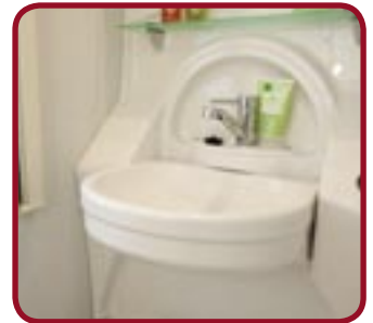
Tip-up sink and small shelf above - not much room to place wash stuff