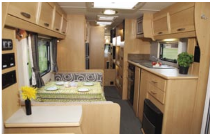
The four-seater dining area and corner bunk stack

Axles: 2 Berths: 6 MRO: 1517kg MTPLM: 1735kg Width: 2.23m Overall length: 7.89m Headroom: 1.90m