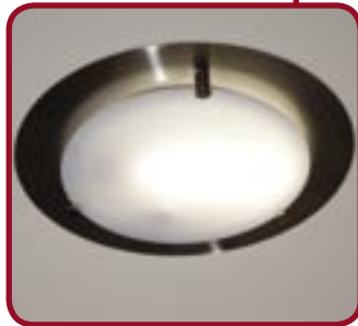
Ceiling lights are plain and circular and give out plenty of light