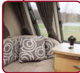
Swirly patterns on cushions and seat backs in white on a pale background