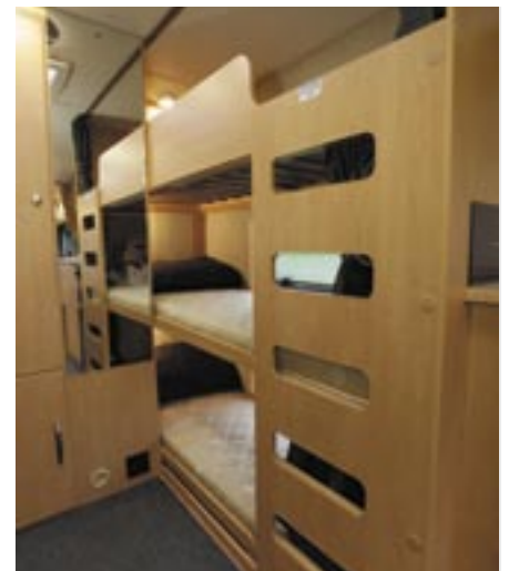
The triple bunk stack in the nearside rear corner

Although this is a lesser-spec'd model than the Tempest, the equipment count is high. This is one great family caravan. So great that one dealer has given it more spec and a new name - see our test of the Elddis Rambler 21/6. ■