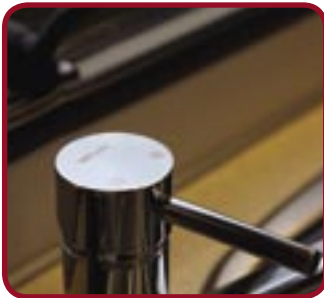
Elddis even puts style on the kitchen tap with the tip-up sink