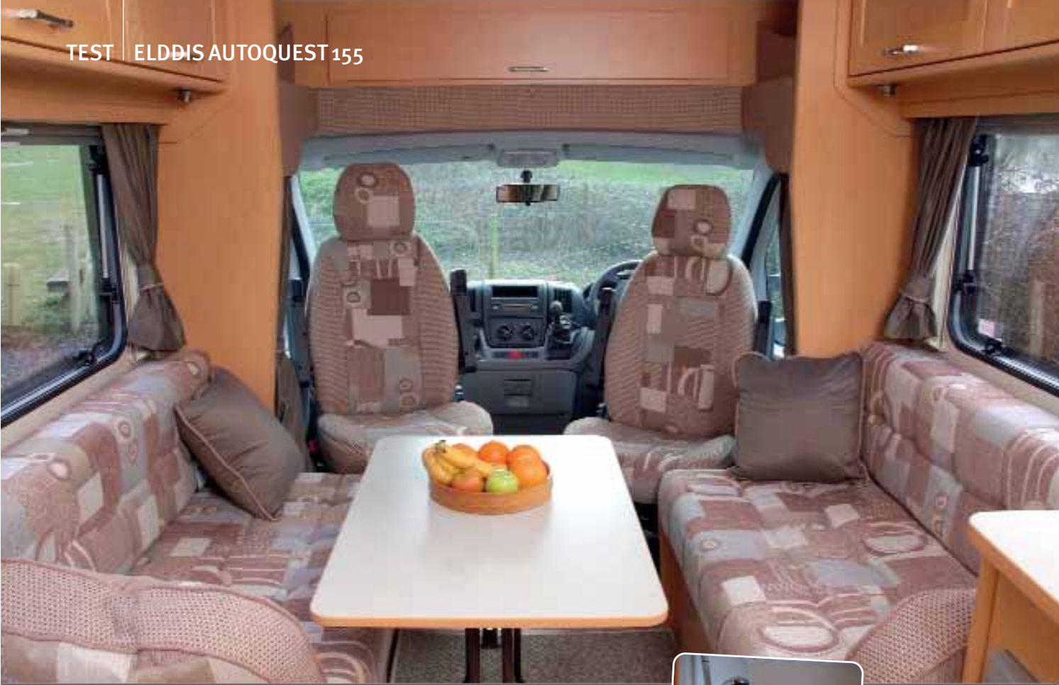
Above: pleasant lounge will accommodate up to six people