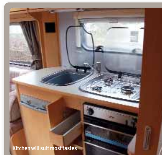
Kitchen will suit most tastes

The rectangular linen-finish stainless steel sink with metal monobloc mixer tap comes with a matching grey plastic washing-up bowl and draining tray. Both sink and hob have ‘Chinchilla’ textured and toughened glass hinged flush covers that double as cutting/chopping boards. The fridge is a big 92-litre Dometic RM7360 with a full-width freezer compartment and no intrusive step. >>