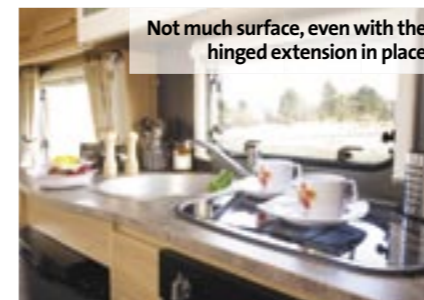
Not much surface, even with the hinged extension in place