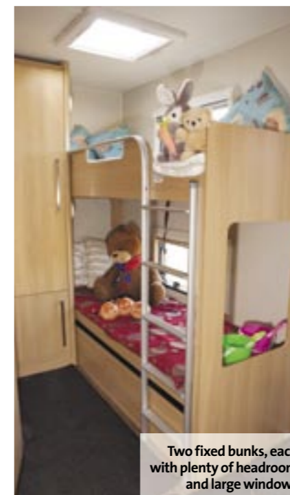
Two fixed bunks, each with plenty of headroom and large windows