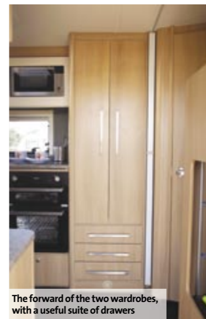
The forward of the two wardrobes, with a useful suite of drawers