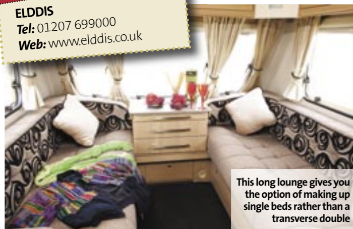
This long lounge gives you the option of making up single beds rather than a transverse double

GET IN TOUCH ELDDIS Tel: 01207 699000 Web: www.elddis.co.uk