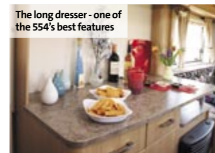
The long dresser - one of the 554's best features