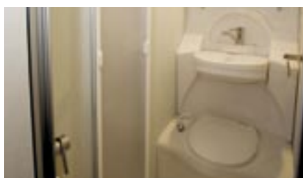
Tip-up sink and large plastic folding partition

same-colour ties. The whole effect is coolly modern - and designed to appeal to a wide variety of tastes by its subtlety of tones. Carpets in this year's Avantés win our praise, too, for their dark colour. They're not deep pile. They don't pretend to look luxurious. What is important is that they are a durable colour and therefore essentially practical. The word "practical" best sums up the layout, too ■