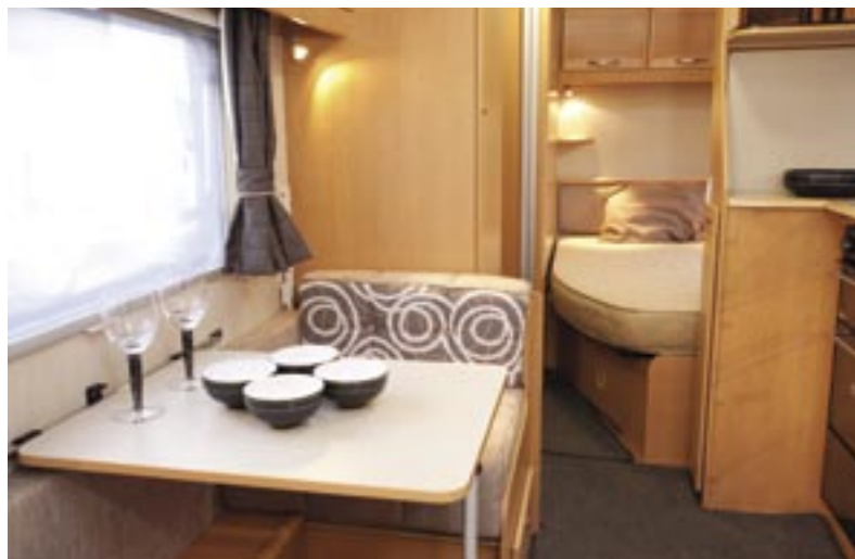
The offside dining area - a superbly practical and versatile layout feature