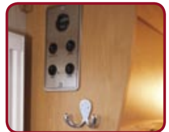
Useful coat hooks just where you need them, alongside the door