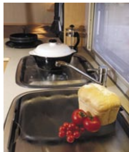
A fixed drainer is a big advantage

same-colour ties. The whole effect is coolly modern - and designed to appeal to a wide variety of tastes by its subtlety of tones. Carpets in this year's Avantés win our praise, too, for their dark colour. They're not deep pile. They don't pretend to look luxurious. What is important is that they are a durable colour and therefore essentially practical. The word "practical" best sums up the layout, too ■