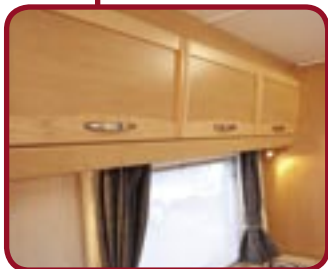
Ample locker space - edged by wooden frames, creating a quality look