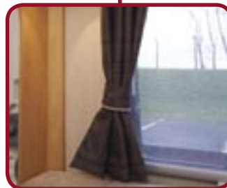
Plain but certainly not boring - these curtains have a light-reflecting quality