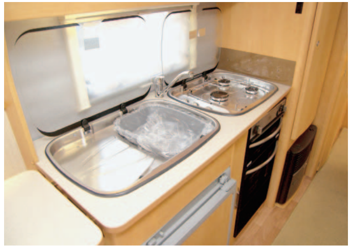
Kitchen comes well equipped

The kitchen is on the offside and comes with oven, grill, three-burner hob and 108-litre Thetford fridge. Storage is limited to the roof lockers while worktop is virtually nil. Panic not, Xplore designers have added a very neat and helpful fold-out flap to help out here. Opposite a side cupboard offers more worktop, storage and also sockets for the TV and heater controls, all neatly together. The nearside dinette offers extra seating and a fold-up bunk, plus