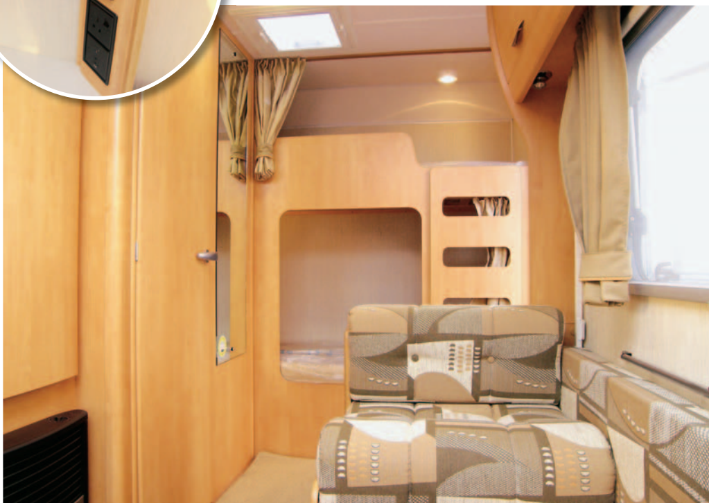
Twin bunks at the rear and roof vent allowing light in