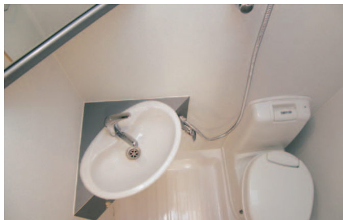
Side washroom has basic essentials and remains practical