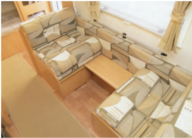
Side dinette offers dining facilities as well as beds

strip of carpet running down the middle of the tourer that doesn't look great – it seems to be a half-hearted attempt at a loose-fit carpet.