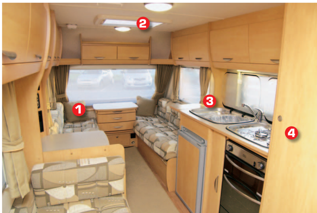
1. The spacious front dinette offers a large double bed or two singles 2. Lighting, both natural and artificial is plentiful 3. A pull-out flap enhances the kitchen worktop area 4. Six people might struggle when sharing this space

T HE Explorer Group has launched its attack on the budget tourer market with the lightweight and well-specified Xplore range, set to rival the Bailey, Sprite and Lunar equivalents. The new 546 is a six-berth that'll really appeal to a growing family. It's competitively priced and lightweight, with a stylish interior that makes a refreshing change to what's currently available on the market.