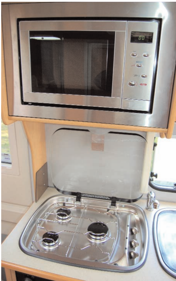
ABOVE: Stainless steel microwave surround is a classy touch RIGHT: Handy garage space

buy a mains-rechargeable lantern from a camping shop, charging it up during the day if you need to.