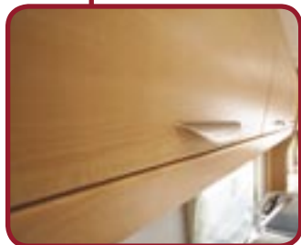
Locker style is smooth and simple with plain handles; wood shade is mellow