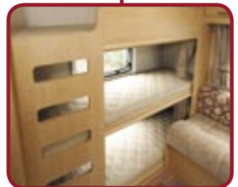
The lower two bunks lift up to give you ample storage for large items