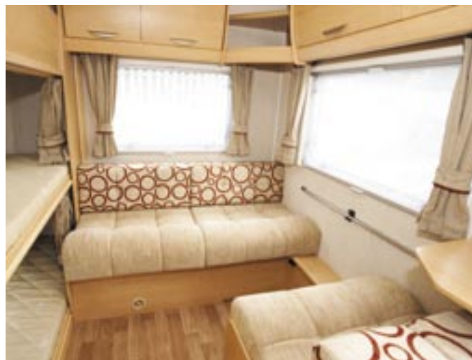
The rear family area is light, airy and spacious