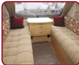
Bold circles of warm terracotta plus lots of plain cream - delightfully modern