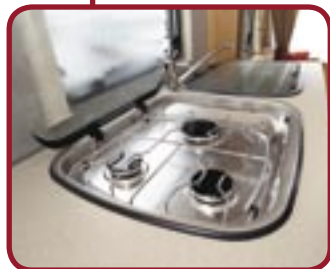
Both hob and fixed-drainer sink have heavy-duty glass covers