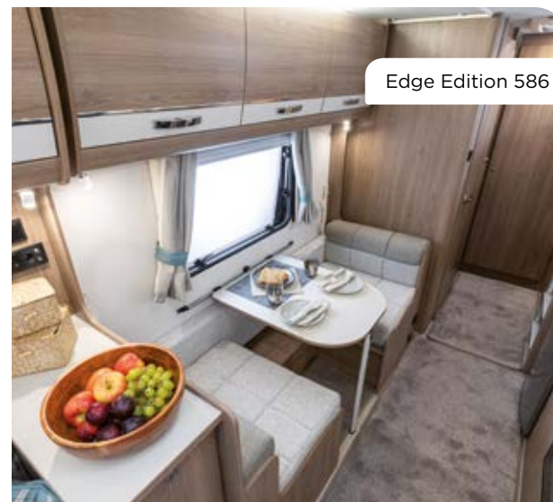
Edge Edition 586