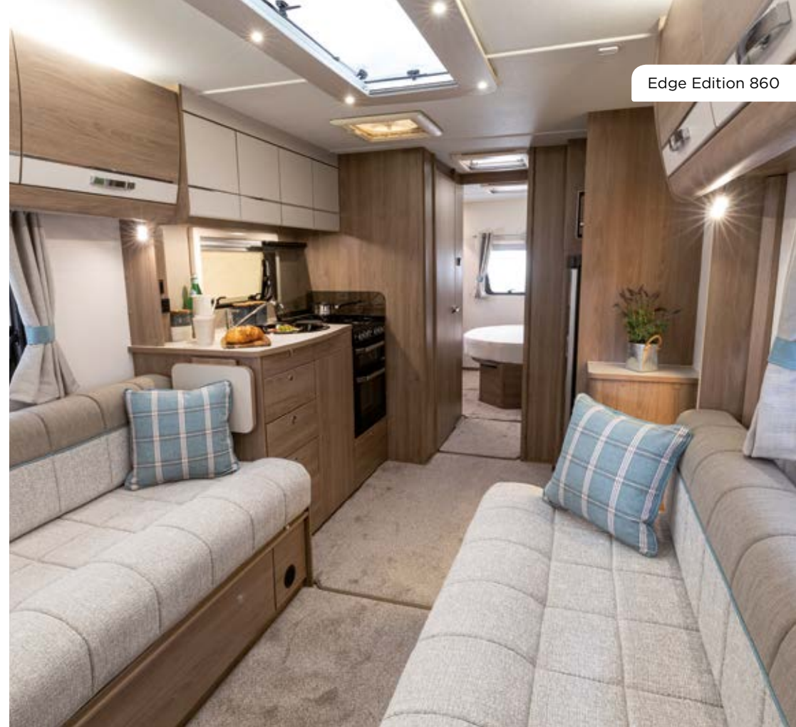
Edge Edition 860